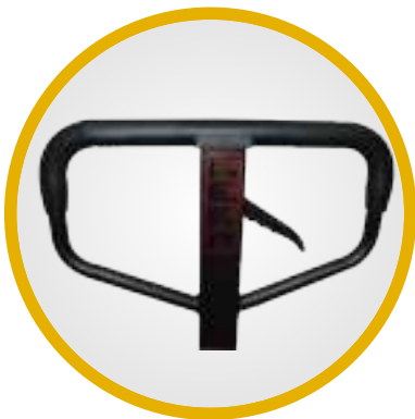
3 Pos. Handle