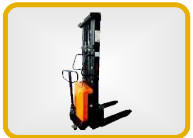
Semi Electric Stacker