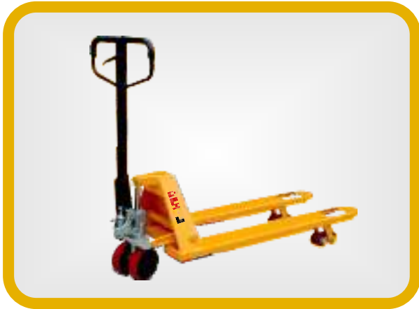
Hand Pallet Truck-LH