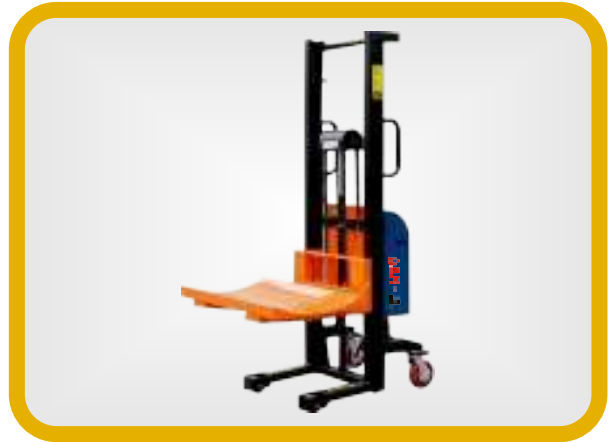
Semi Electric Roll Handler