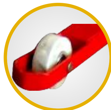
Nylon & PU Wheel