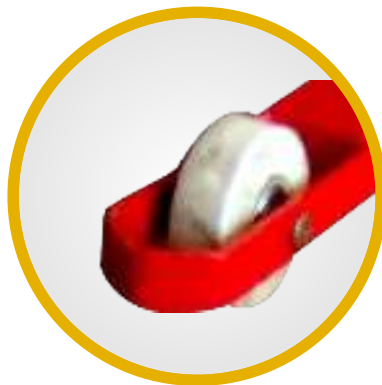
Nylon & PU Wheel