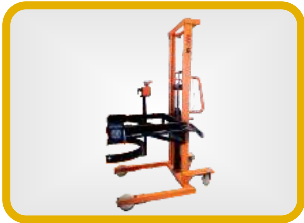
Drum Lifter & Tilter