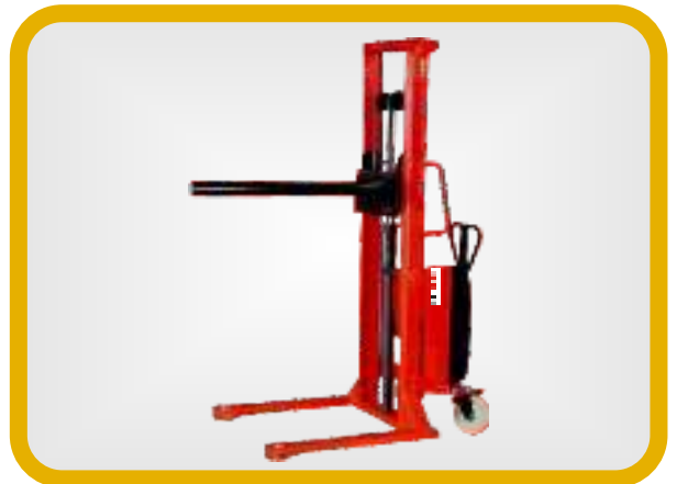
Semi Electric Roll Handler